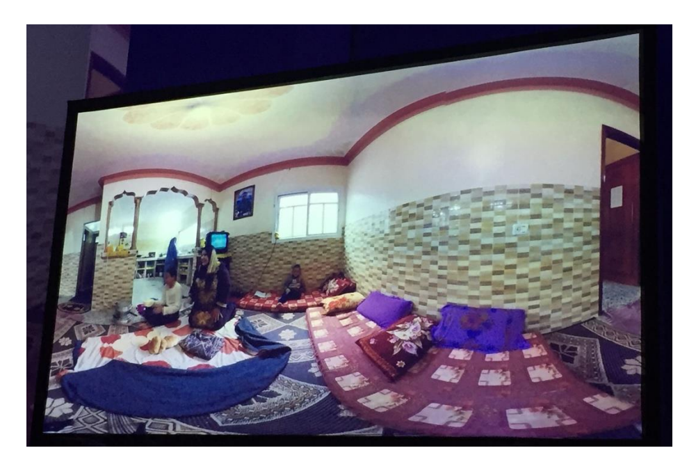
Fig. 3. Bi-dimensional views of the VR experience: "Clouds over Sidra"

These are the words of UNSG Ban Ki-moon during Kuwait opening speech in 2015: "Last night I saw a deeply moving video entitled "Clouds over Sidra". It is an amazing virtual reality production of the starkness of life in the Za'atari Refugee Camp through the eyes of a beautiful young girl by the name of Sidra. She says: 'I have been here a year and a half and that is long enough... but no one knows when it will be safe to go home, nor what will be left for them when they return.'"