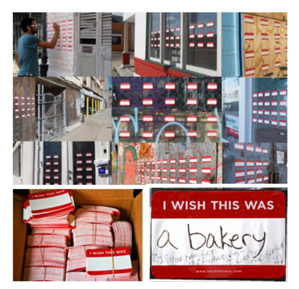
Fig. 1. Materials and outcomes of the project: "I wish this was".