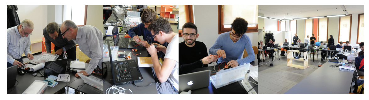
Figure 4. Experimentation and cultural dissemination. Workshop for citizens Moments.