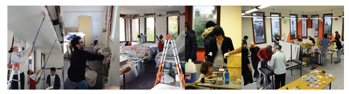
Figure 3. Re-functionalization of Sulbiate Civic Center Moments.

(i) Thanks to the analysis of the territory and of similar projects we understood how a business incubator in Sulbiate was an ill-suited idea. We reacted by changing the direction of the project towards the creation of a cultural hub that will create social business in the territory.