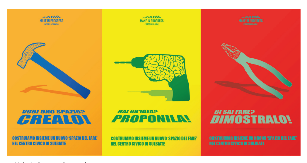
Figure 2. Make in Progress Postcards.

The initiative included several communicative actions both on-line (www.makeinprogress.org/raccolta-di-