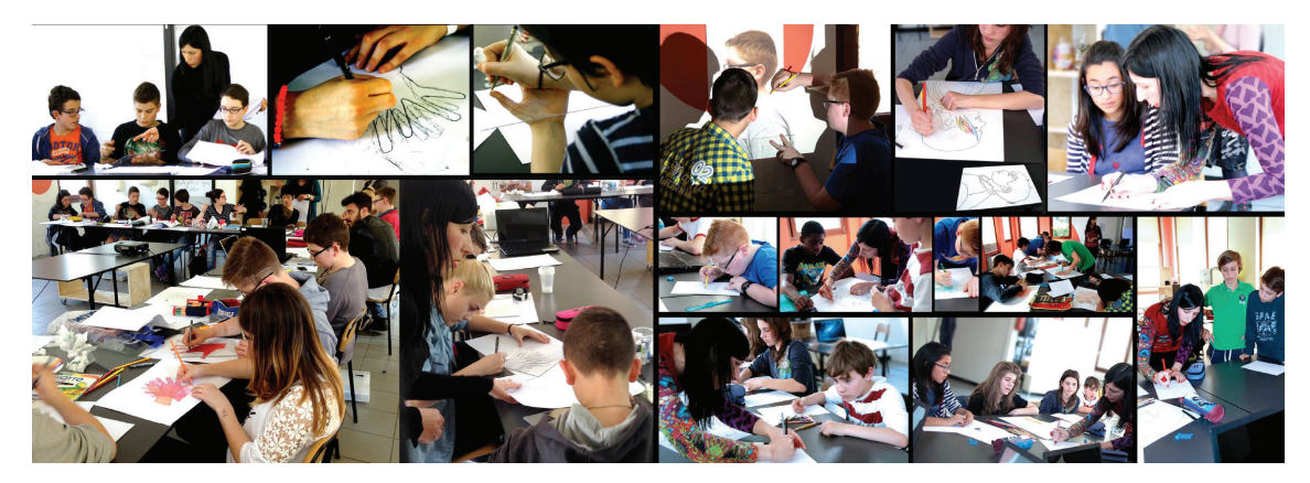
Figure 5. Territorial Networking. Special Projects Moments.

(ii) The success obtained with artistic experimentation workshops revealed a latent artistic demand by part of the territory. Therefore, we expanded on the initial idea of having a simple exhibition area – developed in the first stage of the project – by converting it to an area for artistic experimentation activities and provision of social services.