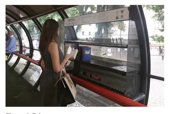
Figure 5. Tuboteca.

To sum up, even if they are not familiar with the entire mechanism of collective emotion, designers are more likely to succeed if they make the interactions that consider the emotional assessment structures and the triggers that originate these interactions their starting point. Moreover, designers should have a good understanding of the group they are designing for and the place where the interaction occurs.