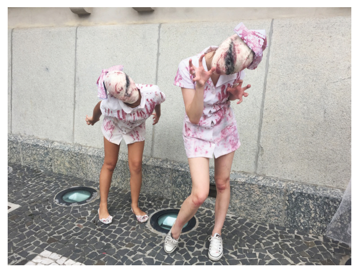
Figure 3. Zombie Walk as a representation of Curitiba's Carnival.