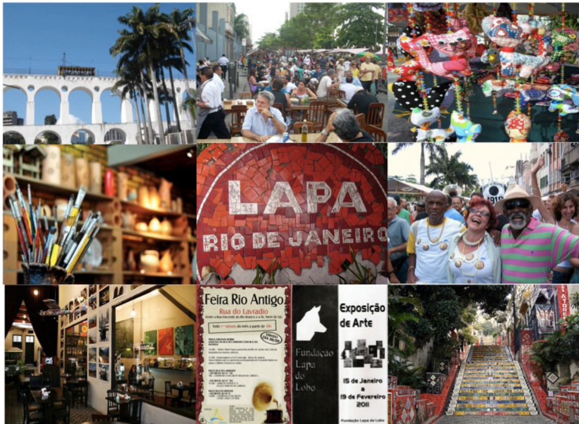
Figure 6. Lapa Art scenario.

showing signs from planning laws that changed the density of the area, focusing on economic value over the cultural one.