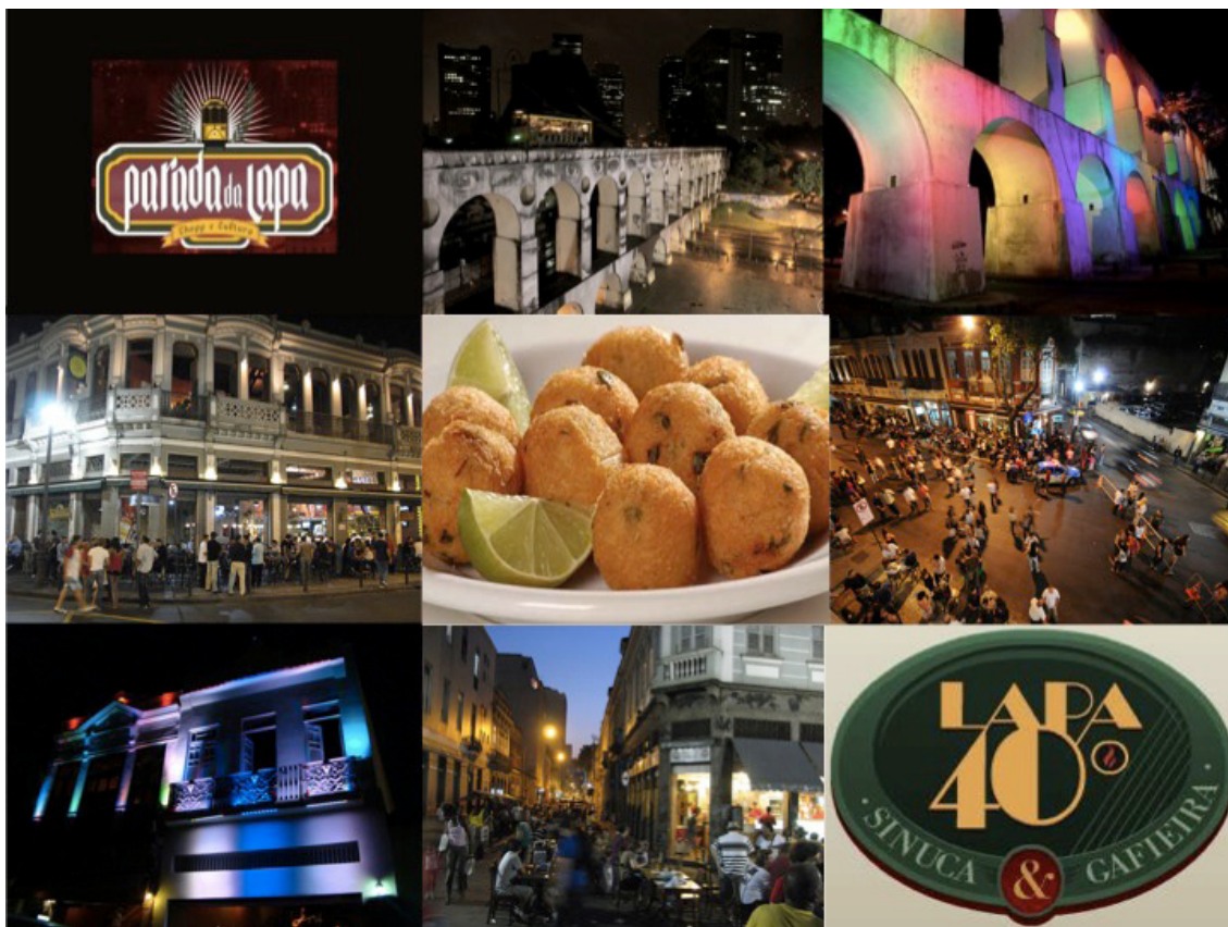
Figure 4. Lapa 25 Degrees scenario.