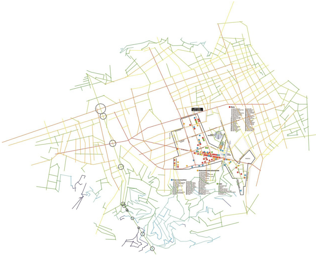
Figure 7. Map of global integration.

given to this place the central role that, in fact, actually occurs. The clipping of the new neighborhood of Lapa shows a part of a more regular morphology, formed by globally important axes, mainly by the presence of a diagonal axis – the Mem de Sá Ave., which unifies the axes in both directions of the grid. This condition reinforces the central role of this avenue and explains the diversity of uses and the concentration of non-residential activities, linked to the bohemian life - bars and nightclubs - but also marks a strong presence of activities related to everyday life, such as bakeries, restaurants, shops, etc. Moreover, this system of axis with high global integration penetrates directly into the city center of Rio de Janeiro, providing high accessibility between Lapa and the downtown area.