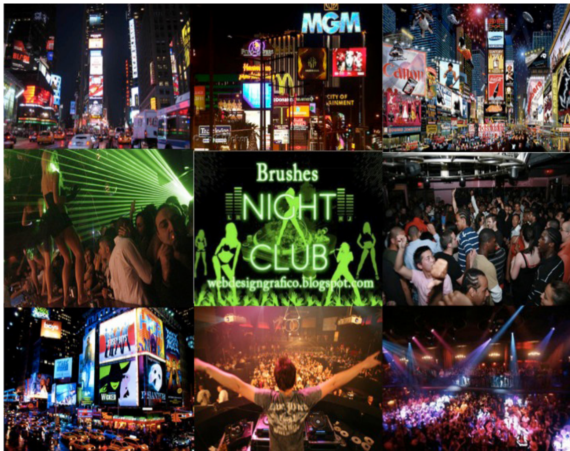
Figure 3. New Lapa scenario.

As seen before, the architect’s mental model structures the process of project oriented towards a unique solution of its own genius loci . On the other hand, Scenarios proposals work as a disruption of this prime mental construction. In Lapa’s case, the mental model points to “Lapa 25 Degrees” scenario, because this one most clearly expressed everyday life aspects of the area. Lapa Garden scenario is still less obvious and difficult to imagine. However, this scenario implies a strong pressure of real estate market in the area and is already