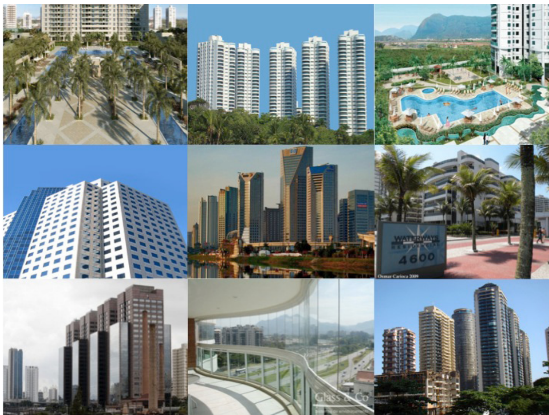
Figure 5. Lapa Garden scenario.