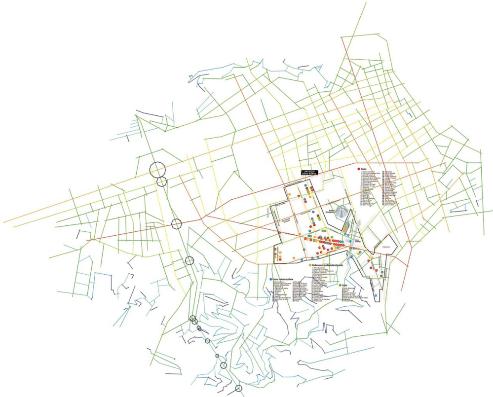
Figure 8. Map of local integration.

tivities, although the estate market focus was on housing for middle and high-income population, which already was a plausible reality linked to the morphological conditions of the place. This case seems to point to the New Lapa scenario (intensification of nightclubs):