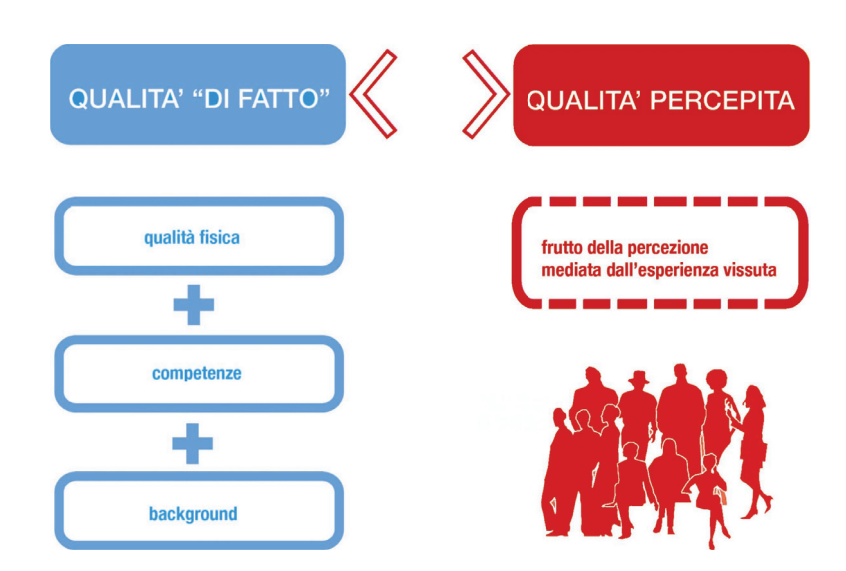
Figure 2. The perceived affective quality, a result of perception mediated by effective experience.

expressing the role of colour at an experimental level, on the perceived affective quality <sup>12</sup>, a result of perception mediated by effective experience. Total duration of project: 3 years. Results: Process model. Experimentation applied to medical structures for hospitalization<sup>13</sup>.