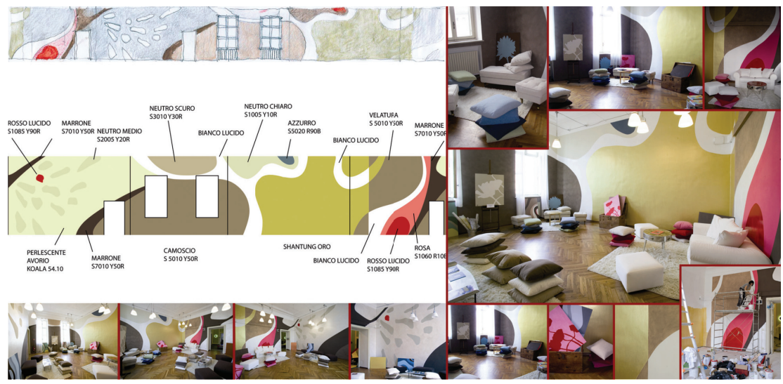
Figure 4. Atelier en tournant.

On a parallel solutions for enhancing colour have been progressed in the sales point, through artefacts (products, services, communication) that spread the use of colour for do it yourself.