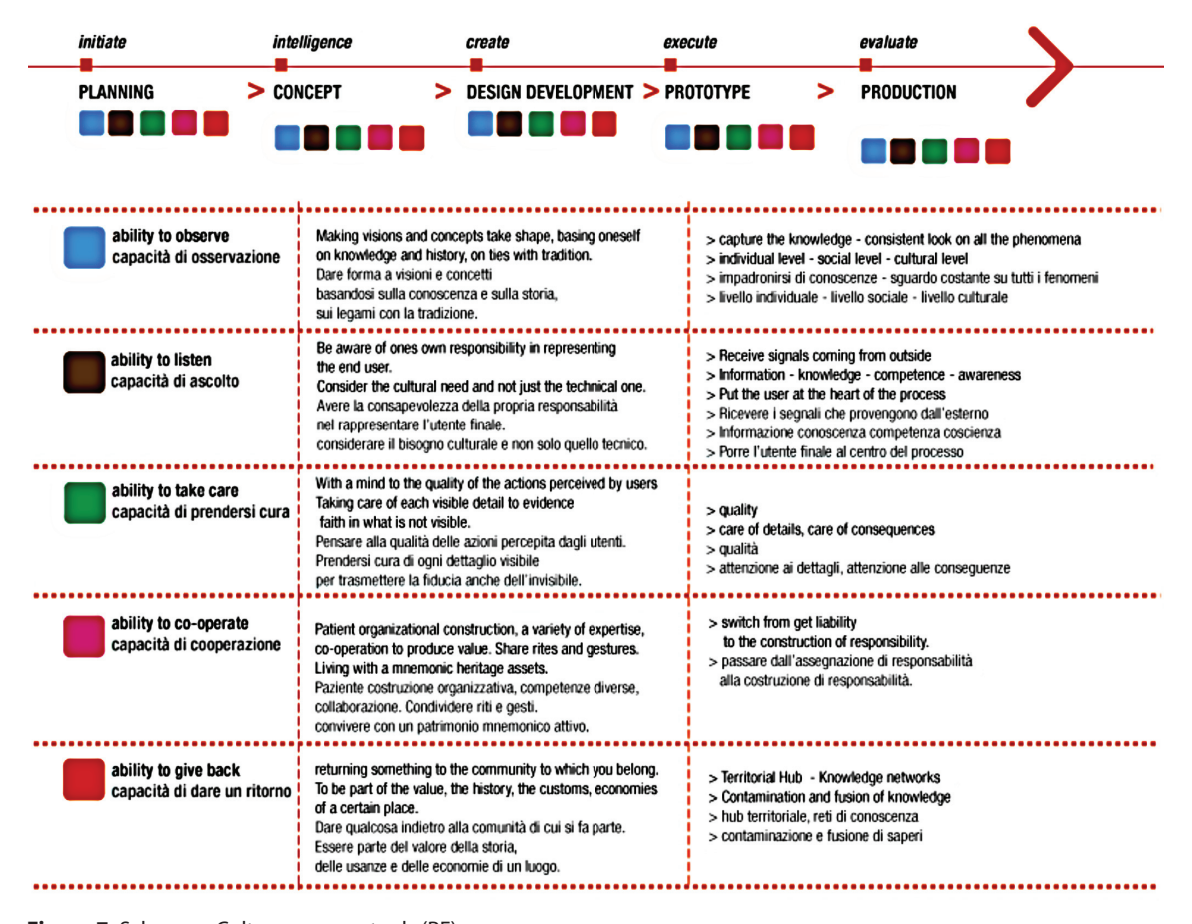
Figure 7. Scheme – Culture process, tools (RF).