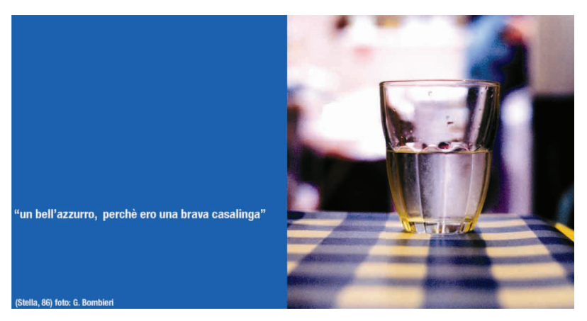
Figure 1. A sort of decompression chamber, capable of transporting from the real world into the world of memories.

Research has set up a tool kit and a method for observing the users and recording their needs through inter-disciplinary co-operation. Resulting data demonstrate a central core of experience, explicitly rendering the interdisciplinary value of the research and, through an evaluation looking back,